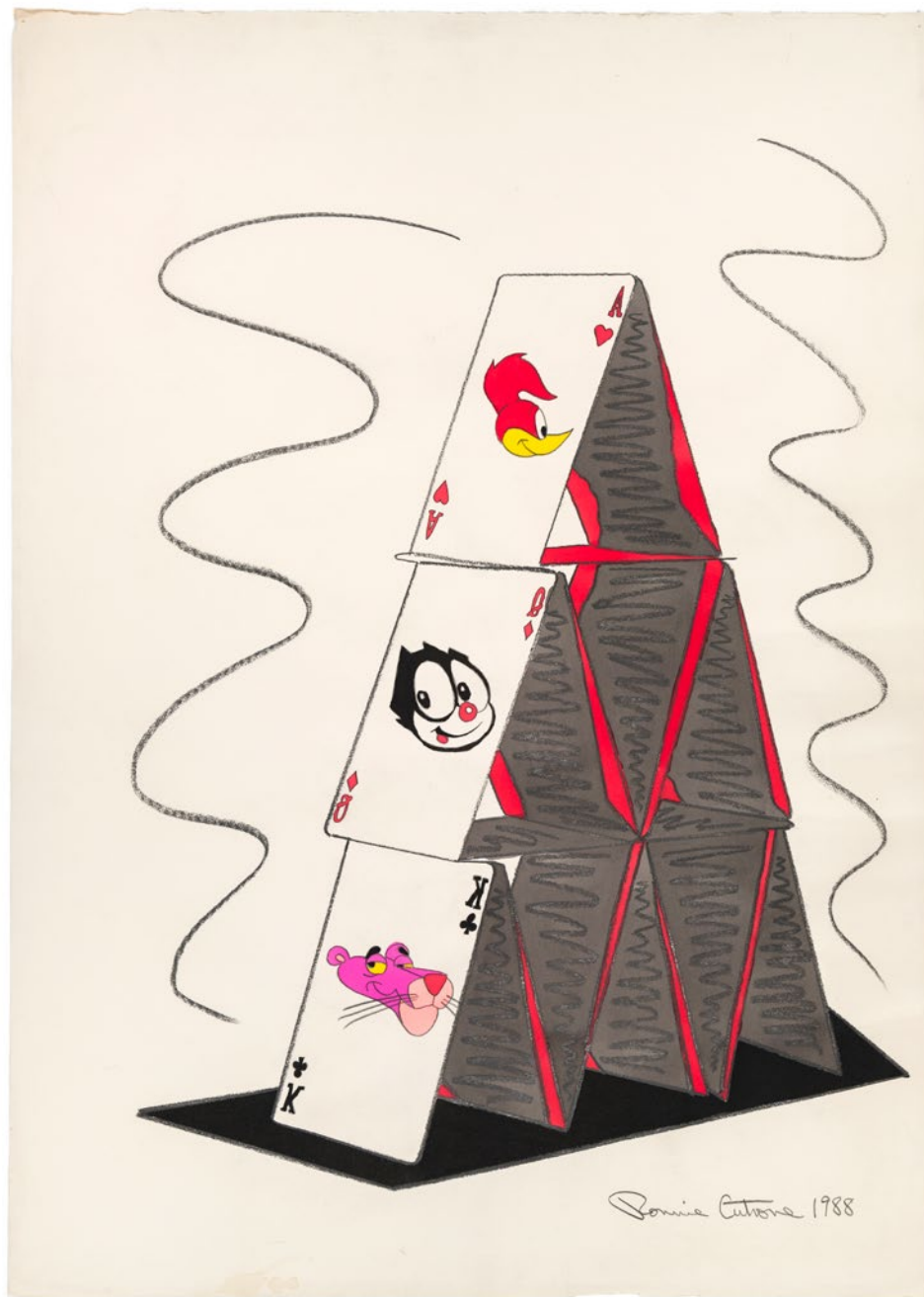
House of Cards 1988