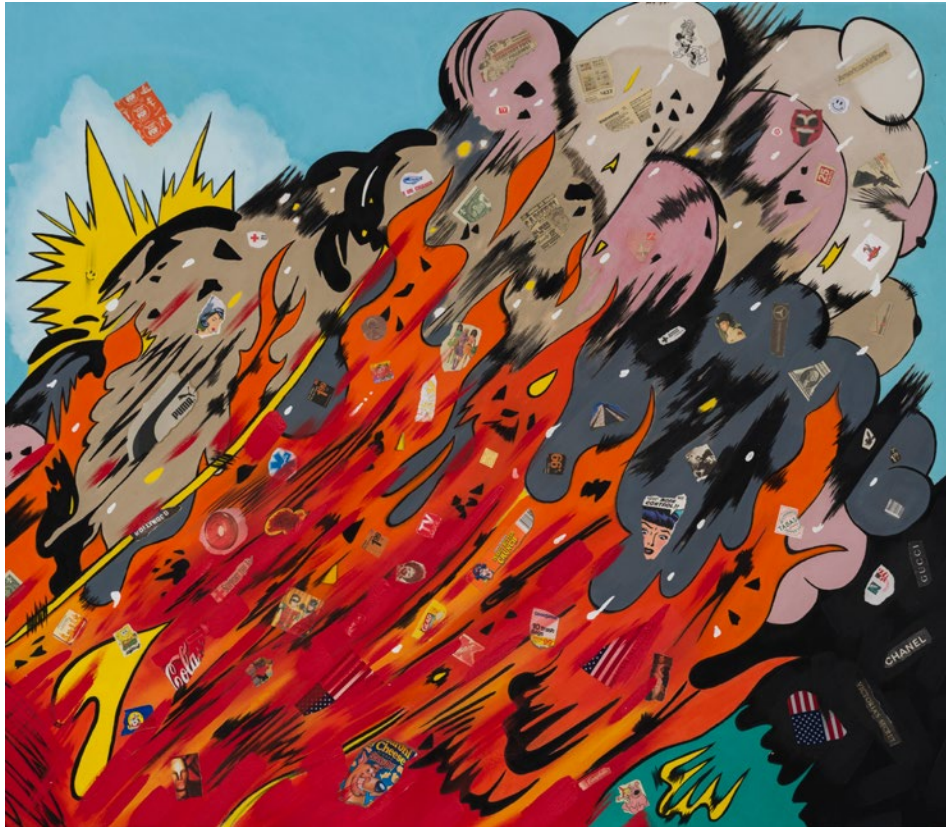
Explosion of Advertisement circa 1988 Mixed media on canvas 152,4 x 174 cm