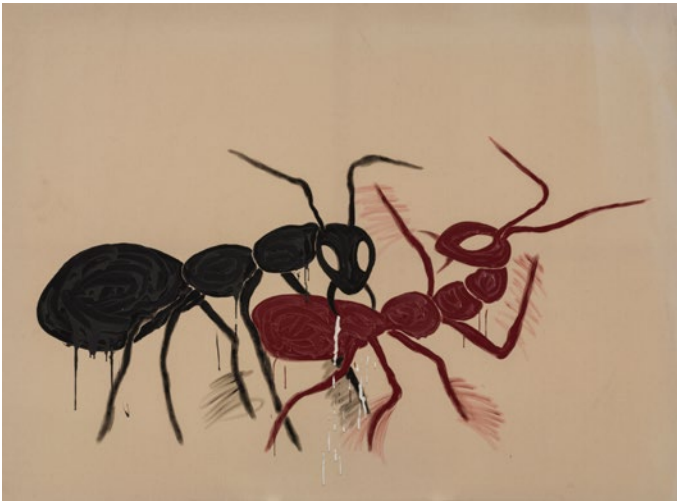
Red and Black Ants 1981 Painting on canvas 148,9 x 203,2 cm