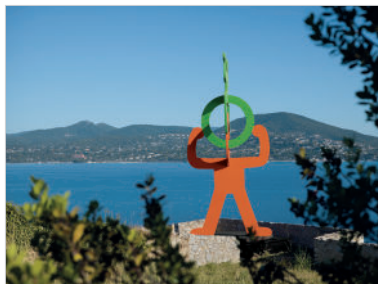
Untitled (Headstand), 1987-1988 Painted steel 700 x 300 x 300 cm