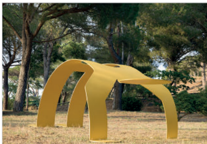
Untitled (Yellow Arching Figure), 1985 Painted steel 189 x 528 x 307 cm

Artworks: © Keith Haring Foundation, 2021