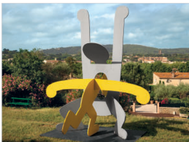
Untitled (Head Through Belly), 1987 Painted steel 750 x 640 x 630 cm