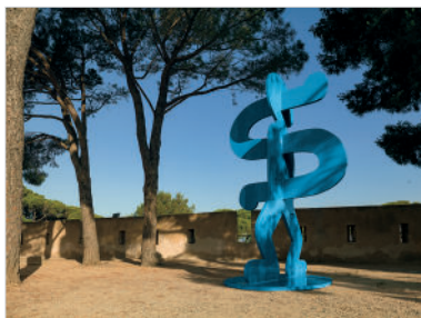
Untitled (S-Man), 1987 Painted steel 370,8 x 218,4 x 226,1 cm Edition on 3