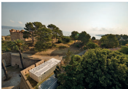
Pop Shop Tokyo, 1988 Mixed media on wood, plaster and steel 236 x 1200 x 496 cm