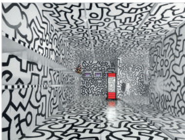
Pop Shop Tokyo, 1988 Interior Mixed media on wood, plaster and steel 236 x 1200 x 496 cm