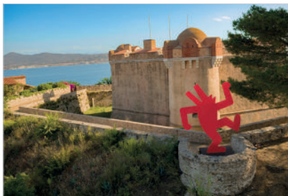
Untitled, 1989 Painted steel 411,5 x 322,6 x 3,8 cm