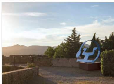
Untitled (Blue Curling Figure), 1985 Painted steel 205 x 343 x 225 cm

Artworks: © Keith Haring Foundation, 2021