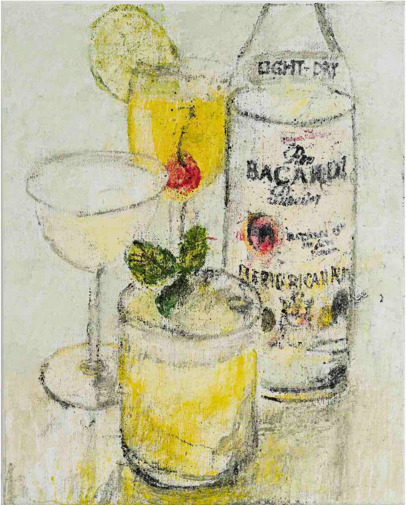
All ways, 2023 Oil on canvas 16 1/8 x 13 in